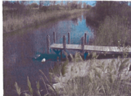
Jones Road boat launch and dock

Objective: Ensure that improvements and upgrades to parks are handicap accessible.