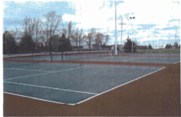
Tennis Courts at Pondsides Park

Provide quality leisure time activities with special consideration given to activities improving health and fitness.