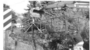
Borton Road widening/resurfacing project included the installation of a walk bridge which was set by the Hampton Township DPW.

Rail Trail upgrades included wider gate openings to make the trail more handicap accessible. The installation of 1/2 mile marker signs and bike signs to alert walkers of the potential of bicycles on the trails. Also, Porta-johns were installed at the East end of the Trail.