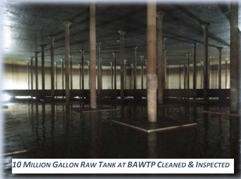
10 MILLION GALLON RAW TANK AT BAWTP CLEANED & INSPECTED