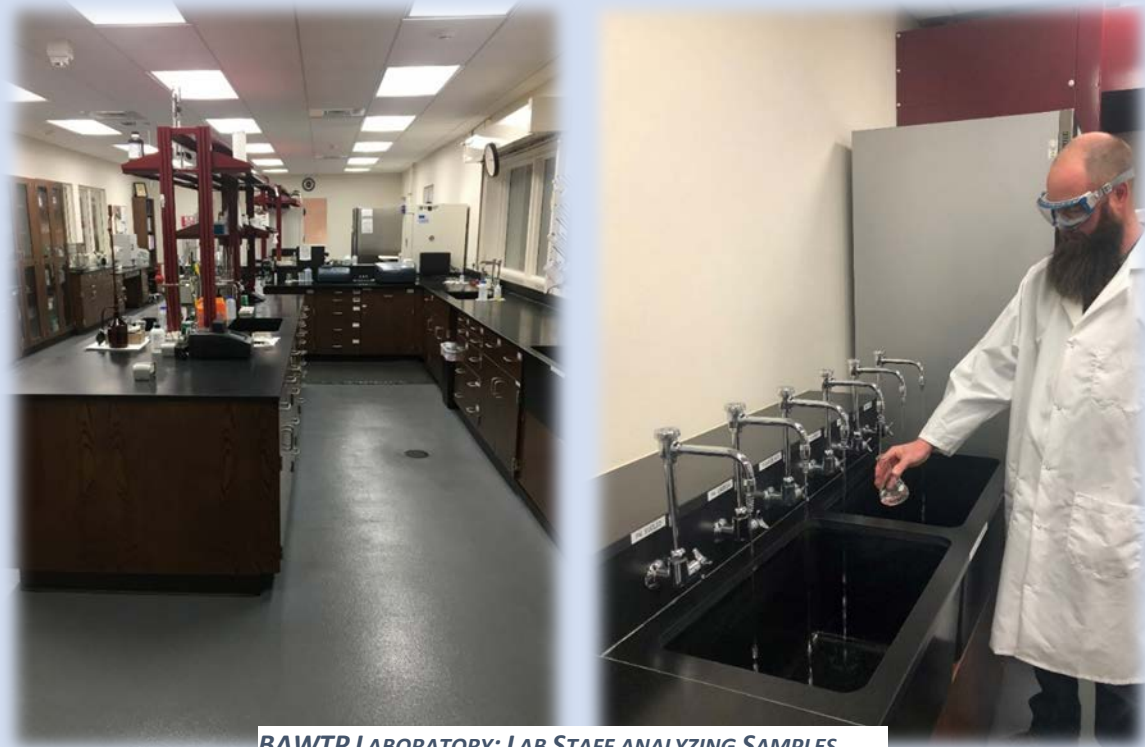
BAWTP LABORATORY; LAB STAFF ANALYZING SAMPLES

Along with bacteriological testing, the lab is capable of analyzing samples for a variety of other substances/water quality indicators. These include chlorine, turbidity (cloudiness of the water), pH, hardness, alkalinity, calcium, sulfate, iron, chloride, conductivity, dissolved oxygen, and orthophosphate. The table below shows the yearly averages for a good number of these.