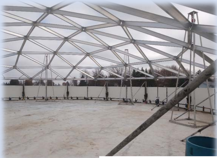
NEW 500,000 GALLON STORAGE TANK AT WILLIAMS TOWNSHIP PUMP STATION