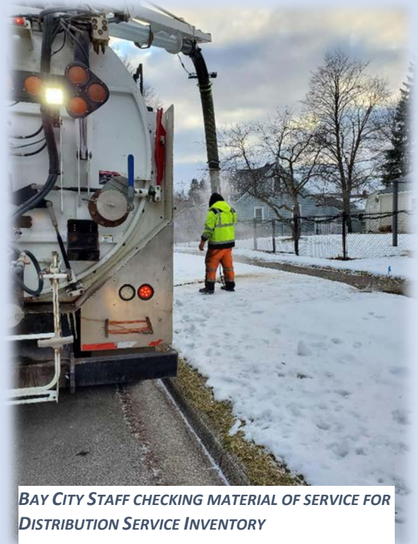
BAY CITY STAFF CHECKING MATERIAL OF SERVICE FOR DISTRIBUTION SERVICE INVENTORY