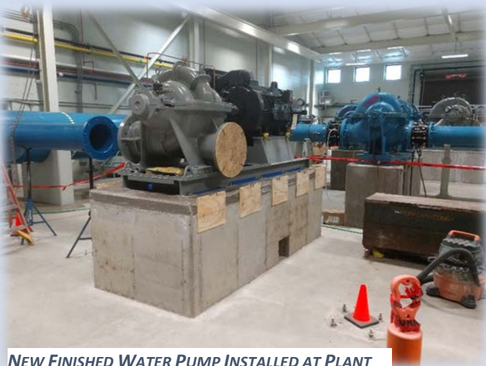
NEW FINISHED WATER PUMP INSTALLED AT PLANT